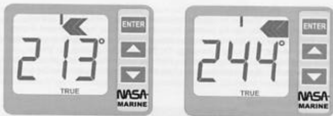
Figure 4a & 4b - Three and ten-chevron Steering indications

If the error increases beyond 180°, the error display reverses to show that the shortest route back to the desired heading is now using the opposite tiller.