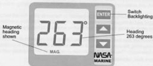
Figure 2 - Normal operation display.

Backlighting is provided to allow the unit to be seen at night. The backlighting is switched on and off by a single press on ENTER.