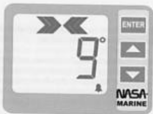
FIGURE 5 - Alarm Boundaries set at +/- 9°

The alarm setting can be altered at any time during normal operation by pressing UP to increase its value, or DOWN to decrease it. The alarm boundaries are shown by the steering chevrons, as shown on Figure 5, for two seconds when the key is released, whereupon the display returns to the normal steering display.