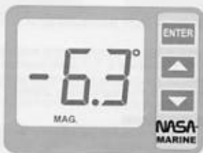
FIGURE 6 - Magnetic Variation Display

If not already in Engineering ("En" displayed), hold down the ENTER button while turning on the power to put the unit into the Engineering mode. The display shows "En" (for Engineering) for two seconds. The display then changes as shown in Figure 6 to show the stored magnetic variation and whether the unit is operating in Magnetic or true modes (Figure 6 shows Magnetic operation, and an Eastward variation of 6.3°).